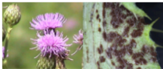
Canada Thistle Biocontrol

Thursday, April 1, 2021 5:30 - 6:30pm via Zoom