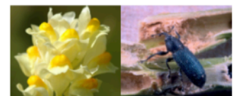
Yellow Toadflax Biocontrol

The Douglas County Conservation District's Mission is helping people help the land by promoting projects through education to further sustainable use of natural resources.