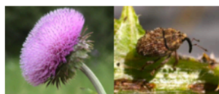
Musk Thistle Biocontrol