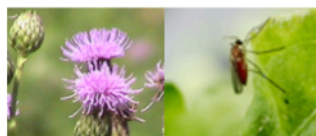
Russian Knapweed Biocontrol