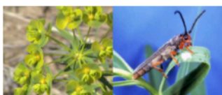
Leafy Spurge Biocontrol