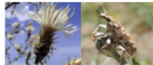
Diff. & Spot. Knapweed Biocontrol