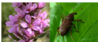
Purple Loosestrife Biocontrol