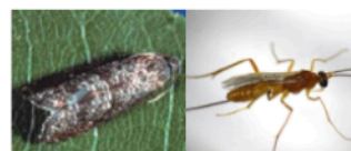
Oriental Fruit Moth Biocontrol