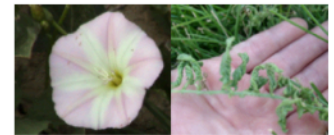
Field Bindweed Biocontrol